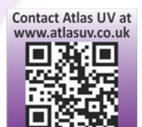
QR code screen